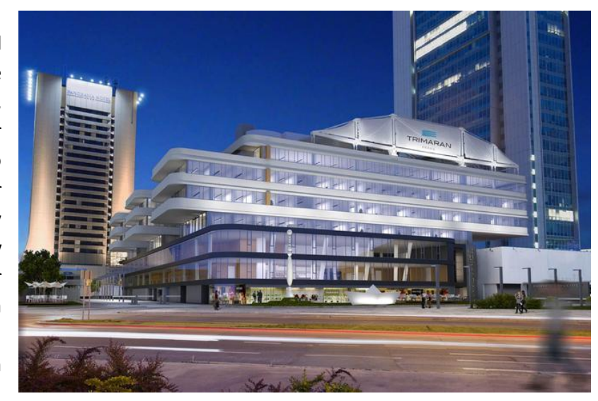
ICHC 2020 Conference Venue - Cubex Centre Prague

possible. It is our great pleasure to extend a warm invitation to everyone to attend what is sure to be a memorable conference. There will be, as usual, emphasis on supporting our younger conferees. We hope to welcome you to Prague and the great ICHC 2020! Plans for 2019: The 60th Symposium of the Society for Histochemistry is preliminarily planned as a session of the COST "Nuclear Organization and Lipids Involvement in Gene Expression" conference to be held on 23-25 October in Prague, Czech Republic.